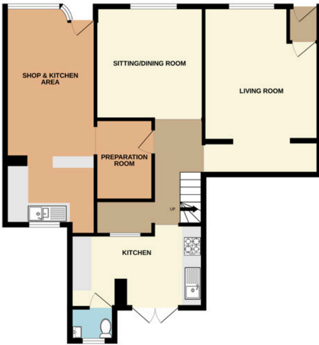
GROUND FLOOR 861 sq.ft. (80.0 sq.m.) approx.