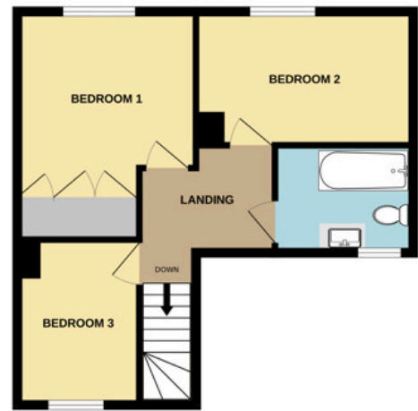
1ST FLOOR 433 sq.ft. (40.3 sq.m.) approx.