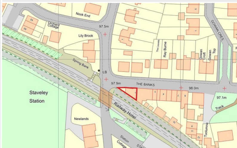
Ordnance Survey Map