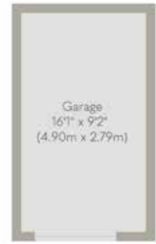
Garage Approximate Floor Area 147 sq. ft (13.69 sq. m)