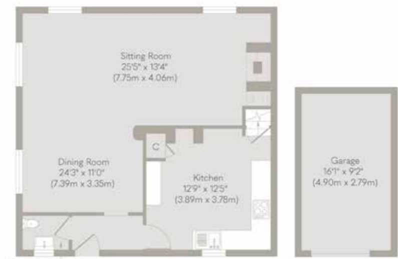
WC 4'9" x 3'7" (1.45m x 1.09m)