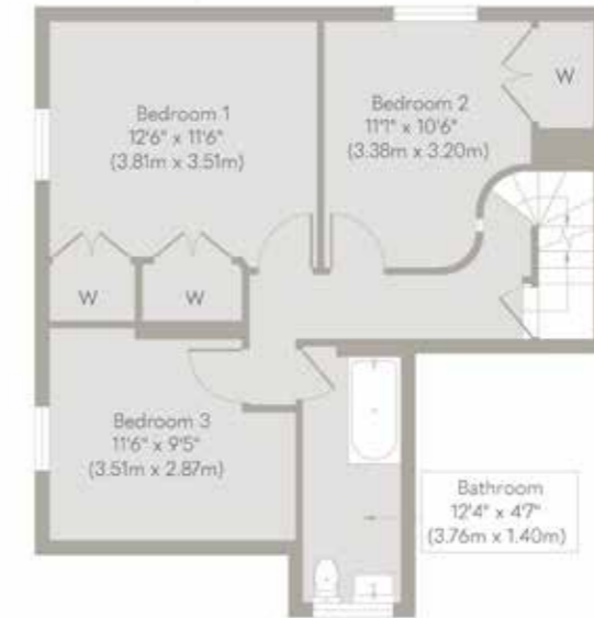
First Floor Approximate Floor Area 545 sq. ft (50.62 sq. m)