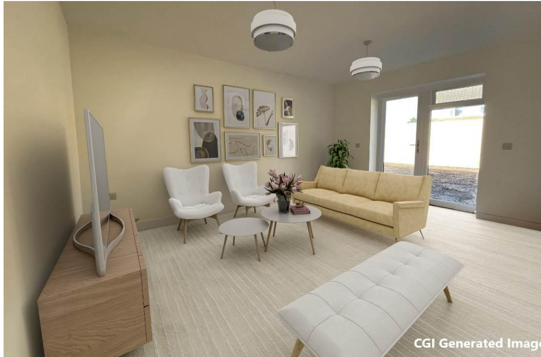
CGI Generated Image