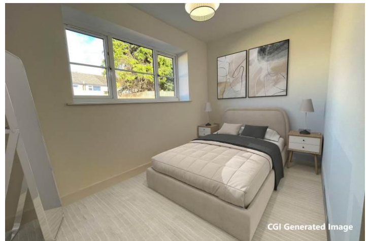
CGI Generated Image