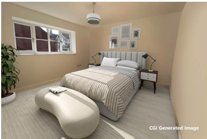
CGI Generated Image