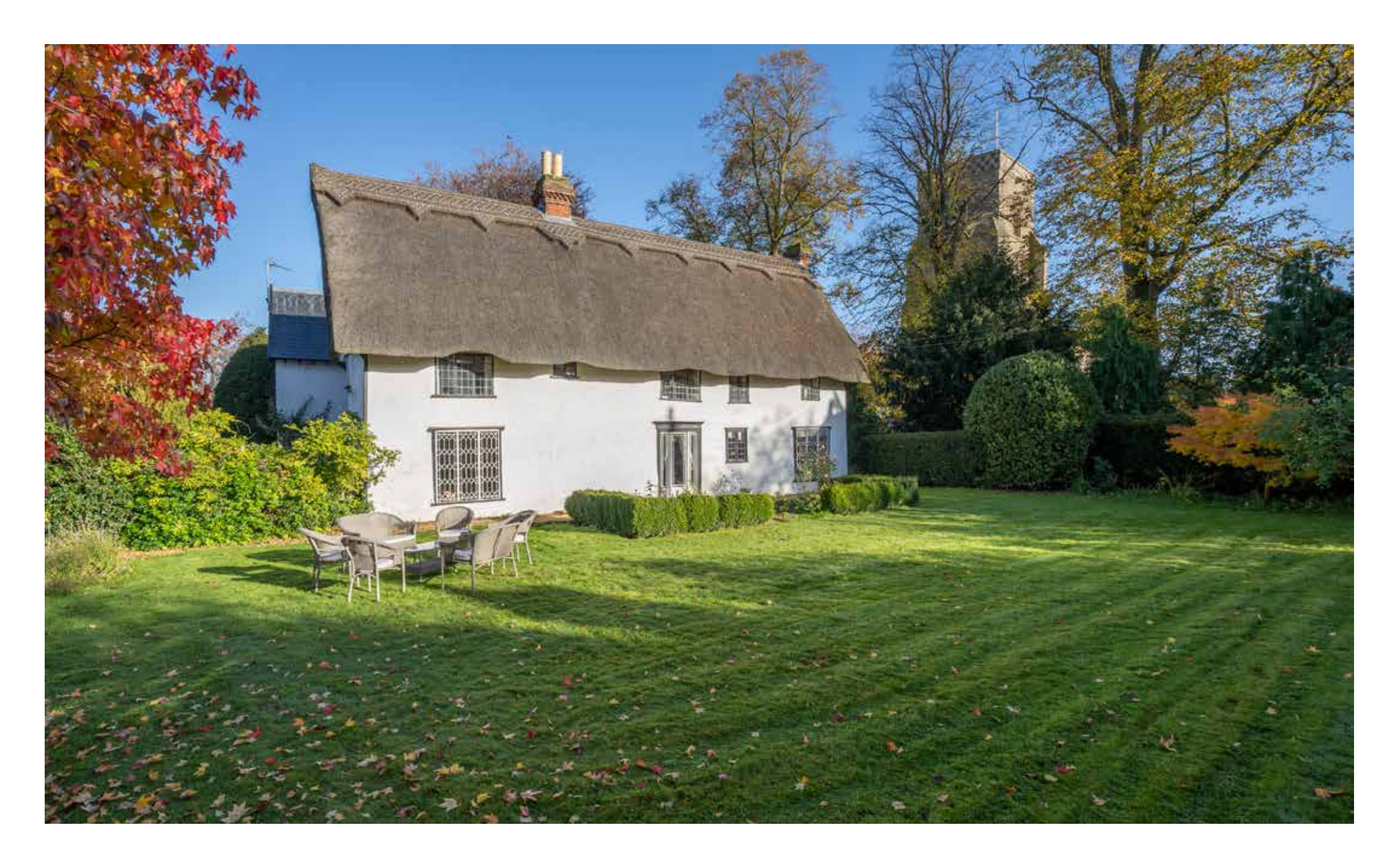
The Old Rectory Church Road | Westhorpe | Suffolk | IP14 4SU