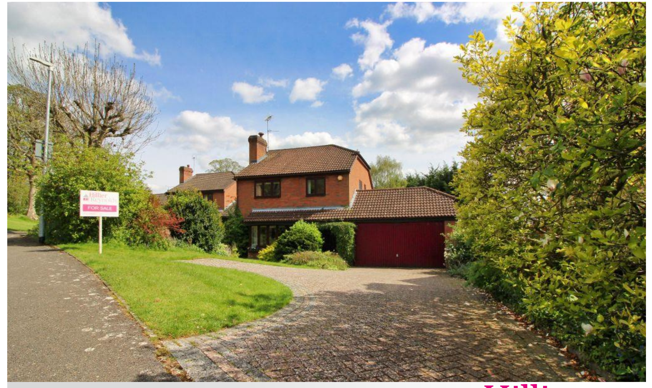
5 COURT MEADOW, WROTHAM, KENT, TN15 7DP