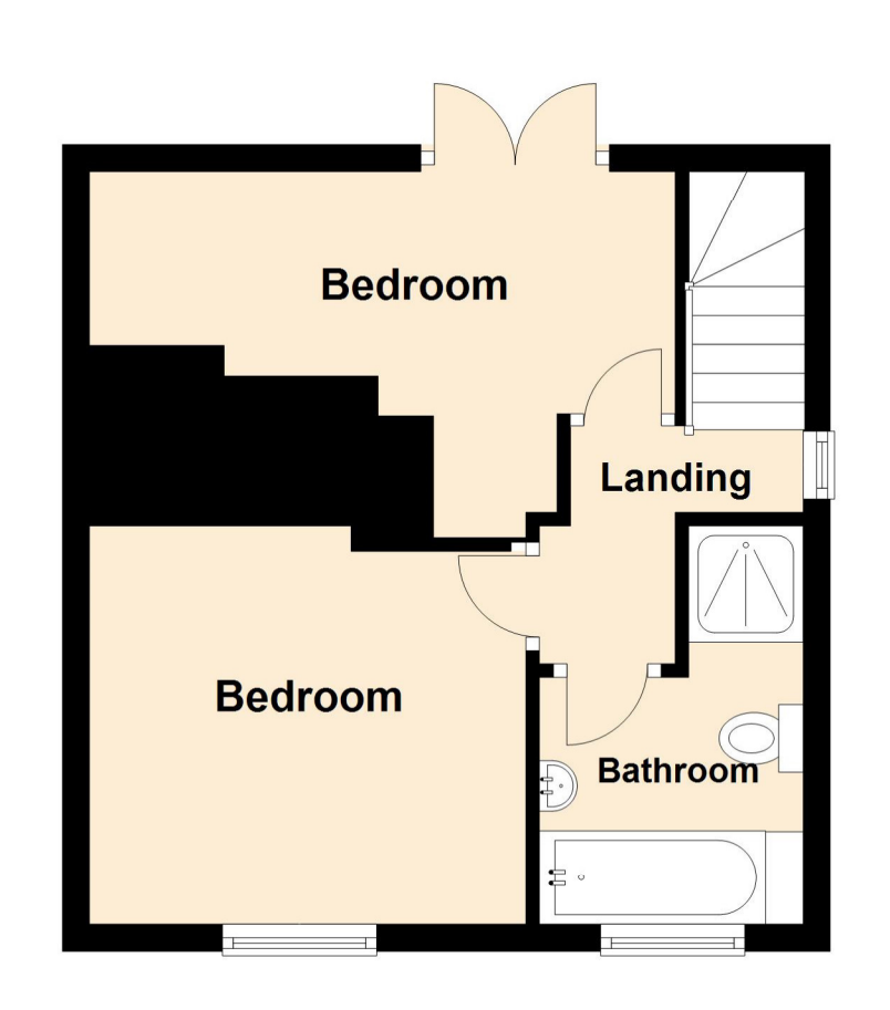
Ground Floor Approx. 40.2 sq. metres (433.0 sq. feet)