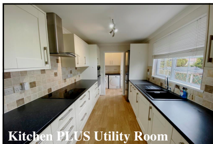
Kitchen PLUS Utility Room