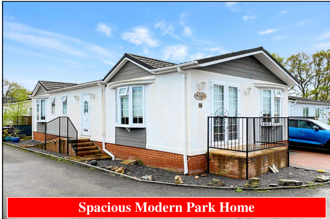
Spacious Modern Park Home

14 Hillbury Park, Alderholt, Fordingbridge. SP6 3BW