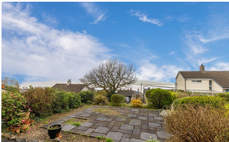
View from the front of the property