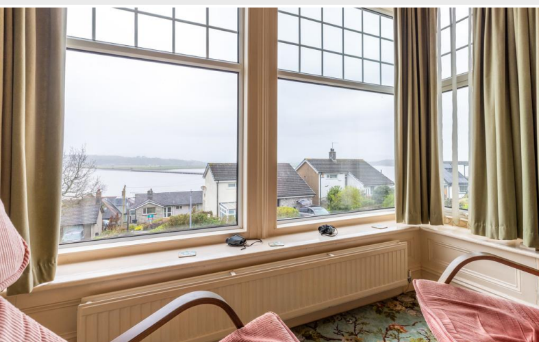
Views From Living Room Over The Kent Estuary