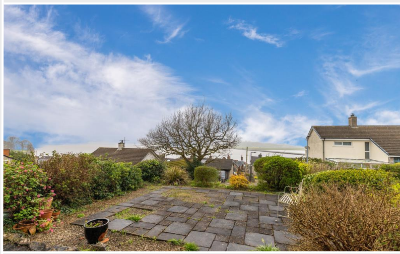
View from the front of the property