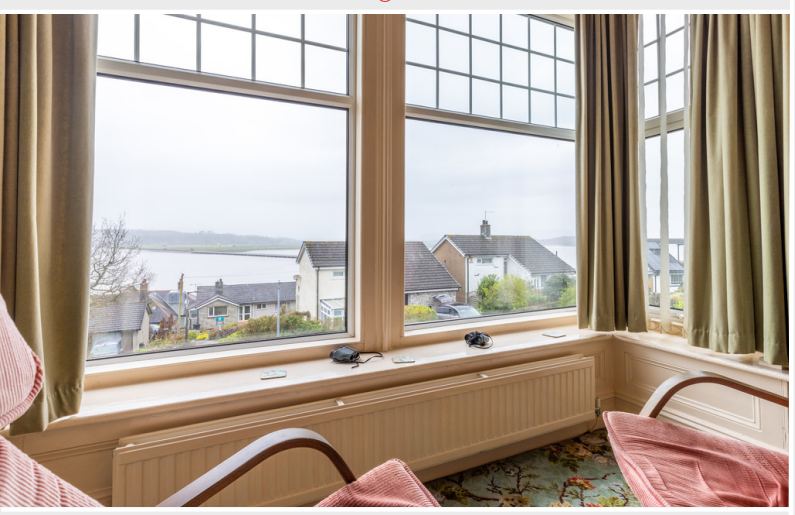
Views From Living Room Over The Kent Estuary