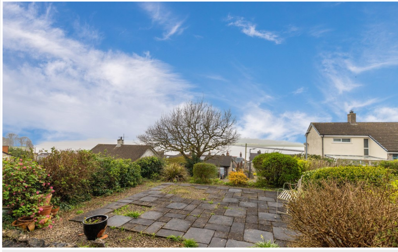
View from the front of the property