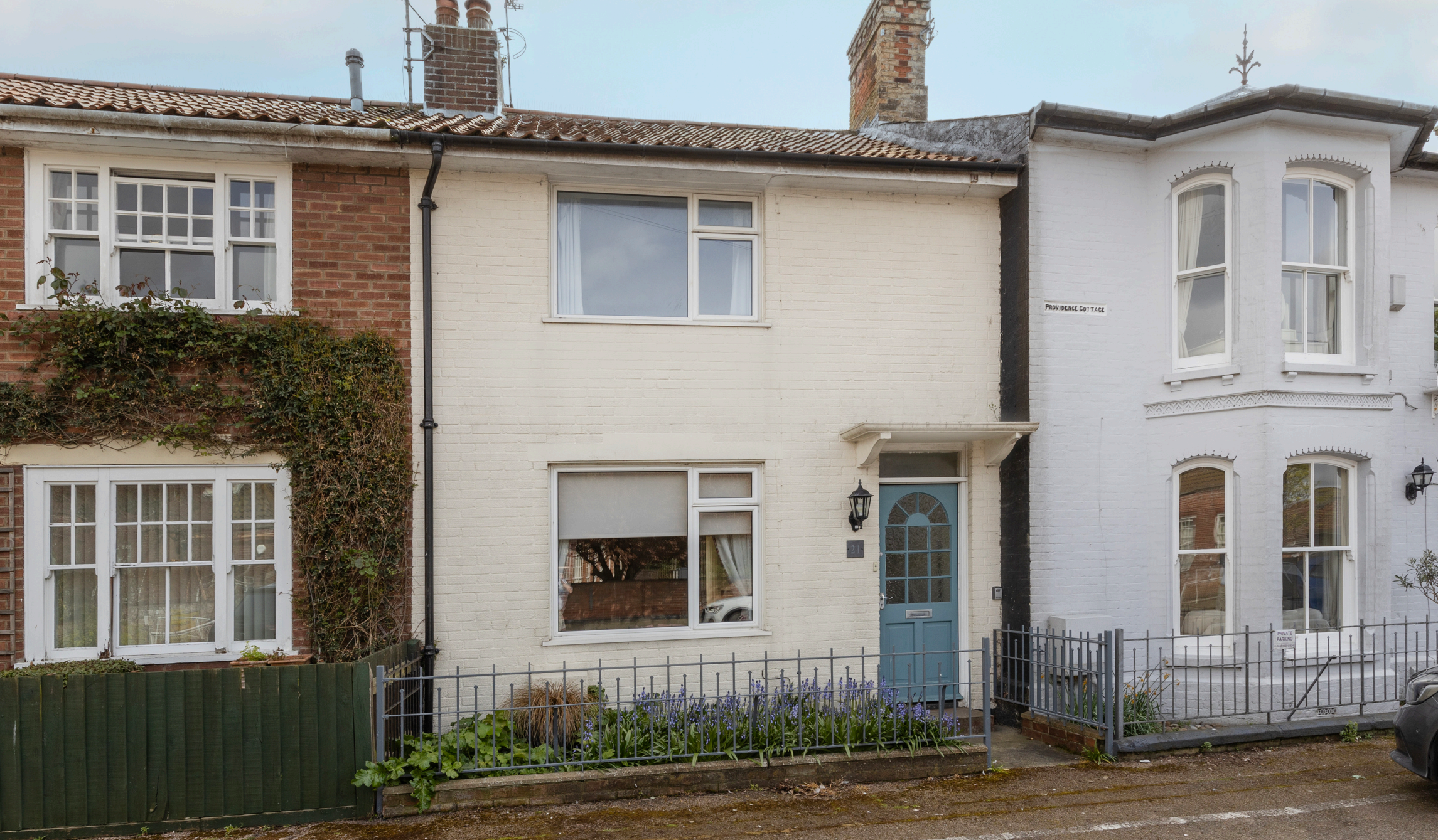
21 CUMBERLAND ROAD SOUTHWOLD