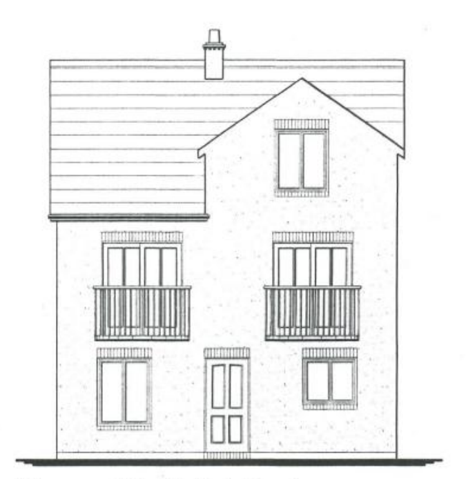
Proposed North East Elevation