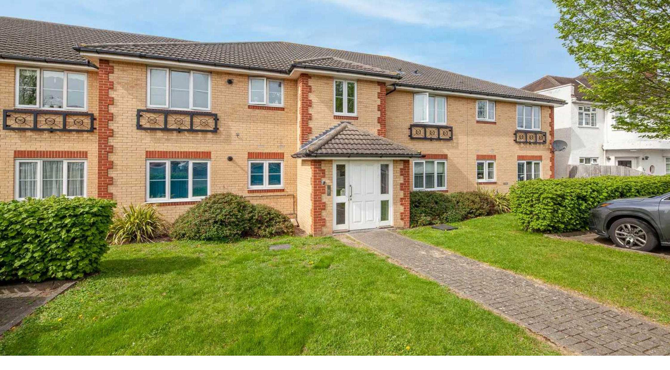
Flat 14, Hawthorn Court Herent Drive, Ilford