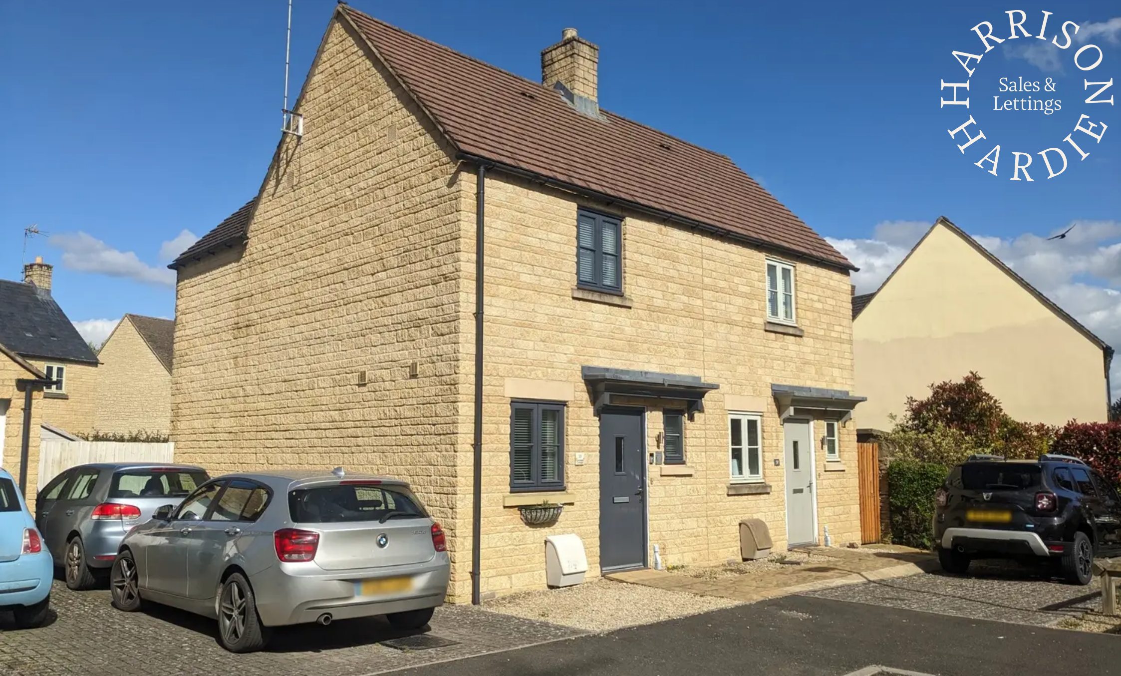
Barnsley Way, Bourton-On-The-Water