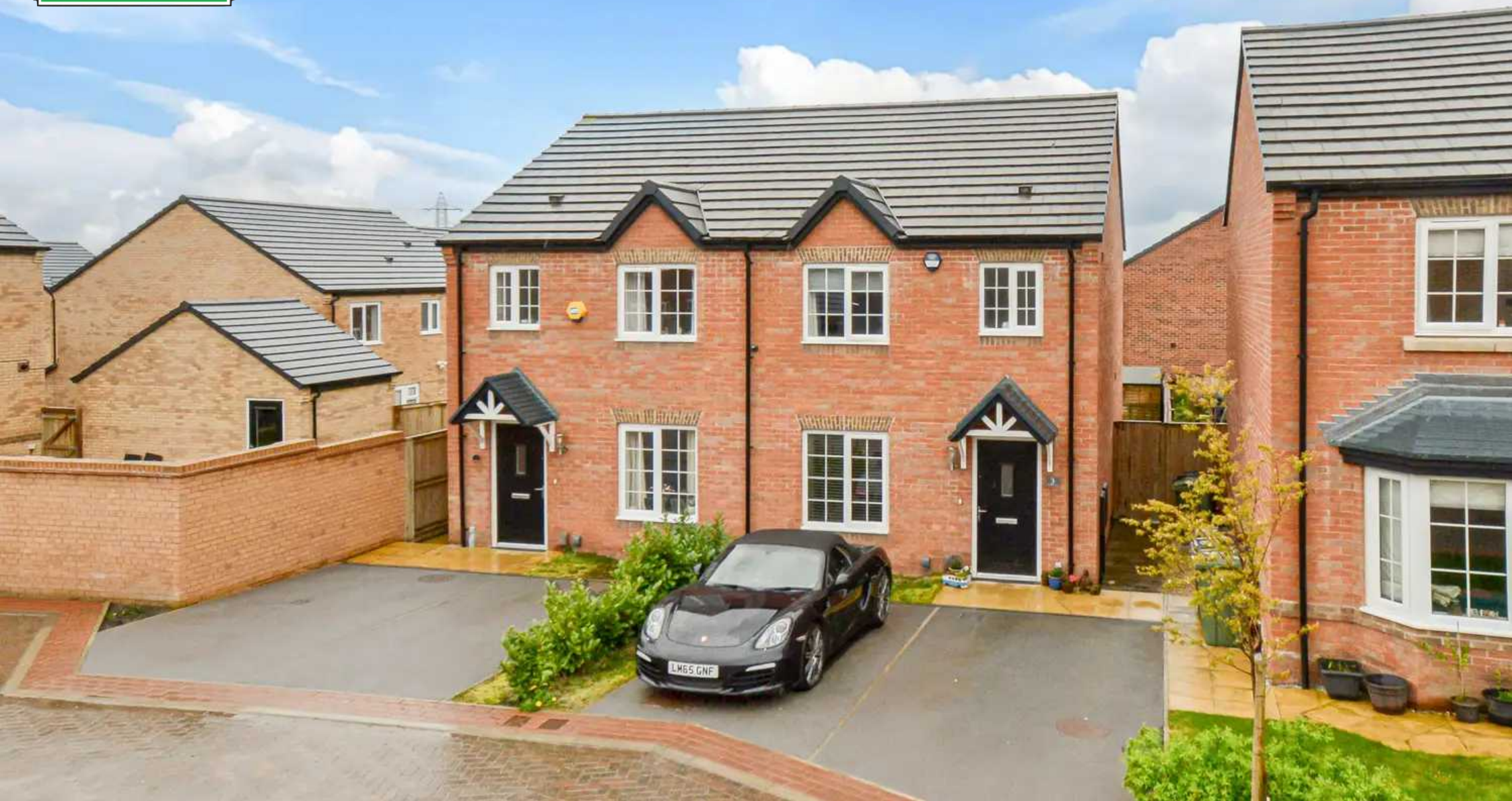
3 Lavender Court, Mirfield Mirfield, WF14 0DZ