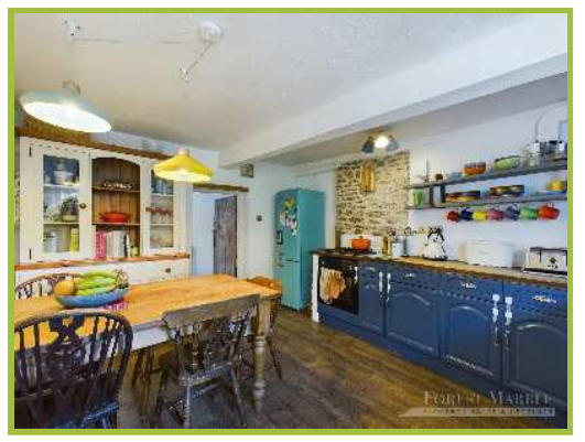
The Butts, Frome