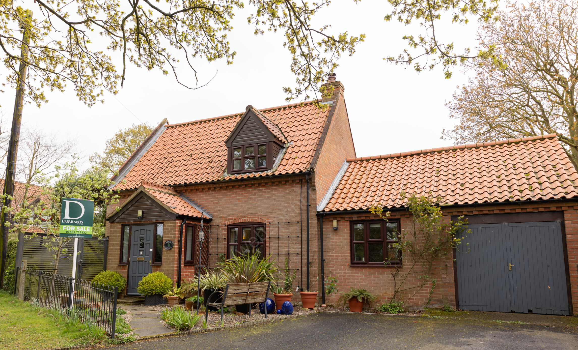
ROWAN COTTAGE LILY LANE, ALDEBY