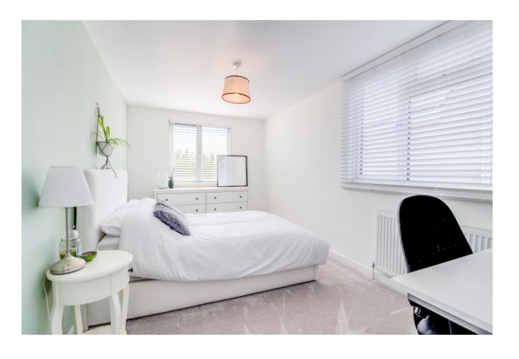
BEDROOM THREE 9' 3" x 8' 5" (2.82m x 2.57m)

Skimmed ceiling. Double glazed windows to rear and side aspects. Radiator.