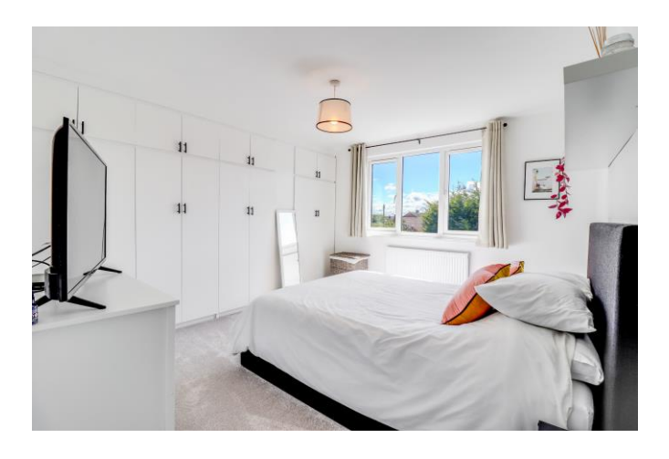
BEDROOM TWO 16' 4" x 8' 7" (4.98m x 2.62m)

Skimmed ceiling. Double glazed window to rear aspect. Built in wardrobes. Radiator.