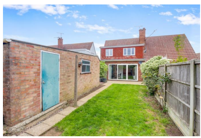
GARAGE 21' x 11' (6.4m x 3.35m)