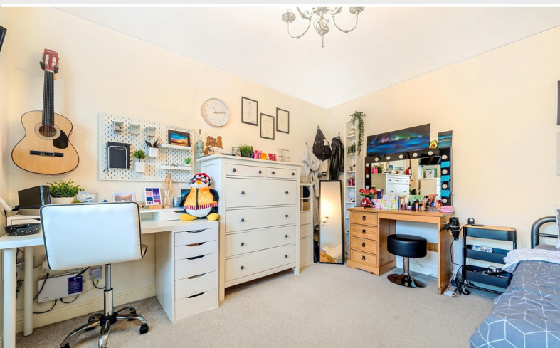
Dining Room / Bedroom Five