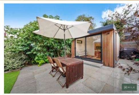
Doyle Gardens, London NW10 £685,000 Leasehold

Exceptional garden flat set on this great road in Kensal Rise. Those looking for a truly exceptional garden apartment well situated in Kensal Rise, look none further. Finished to a high standard; loved and nurtured by the current owners; this home will not disappointment. Set on this quaint road of Doyle Gardens, your future home benefits from a stunning bedroom, with bay windows and built in storage, a further double bedroom with garden views, a contemporary three piece bathroom and a stunning homely open plan kitchen living area. Rare for any garden apartment in the area, via the kitchen, there is access to a London garden of dreams. Almost three sections to enjoy and entertain. To the rear of this oasis, homes a generous and modern 13ft home office come summer house. Located idyllically, whereby one is walking distance to bother Kensal Rise & Kensal Green stations, though off set enough within prime Kensal whereby one can be more recluse and bask in the 55ft garden or take a short walk to King Edward park. Doyle Gardens is an extremely popular residential road and this property is ideally located for Chamberlayne Road and College Road's many restaurants, pubs, vintage shops and both Kensal Rise (Overland) and Kensal Green (Bakerloo line & Overground) stations plus numerous bus routes.