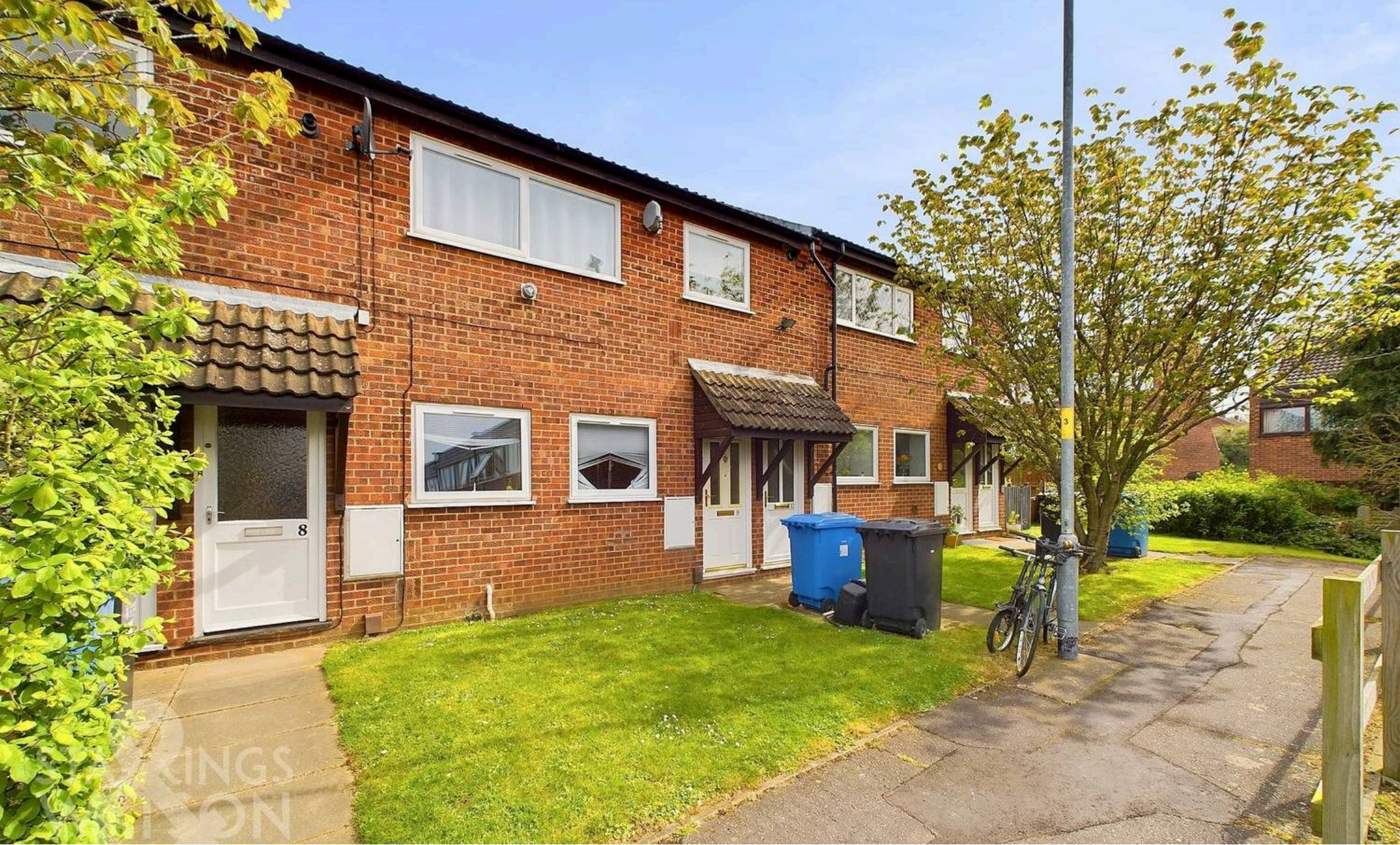
Windmill Court, Norwich - NR3 4ET