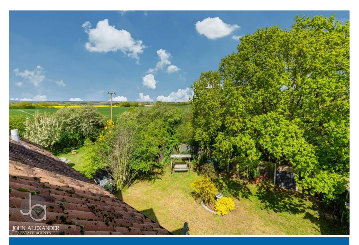
Harvesters, Tolleshunt D'arcy CM9 8UF