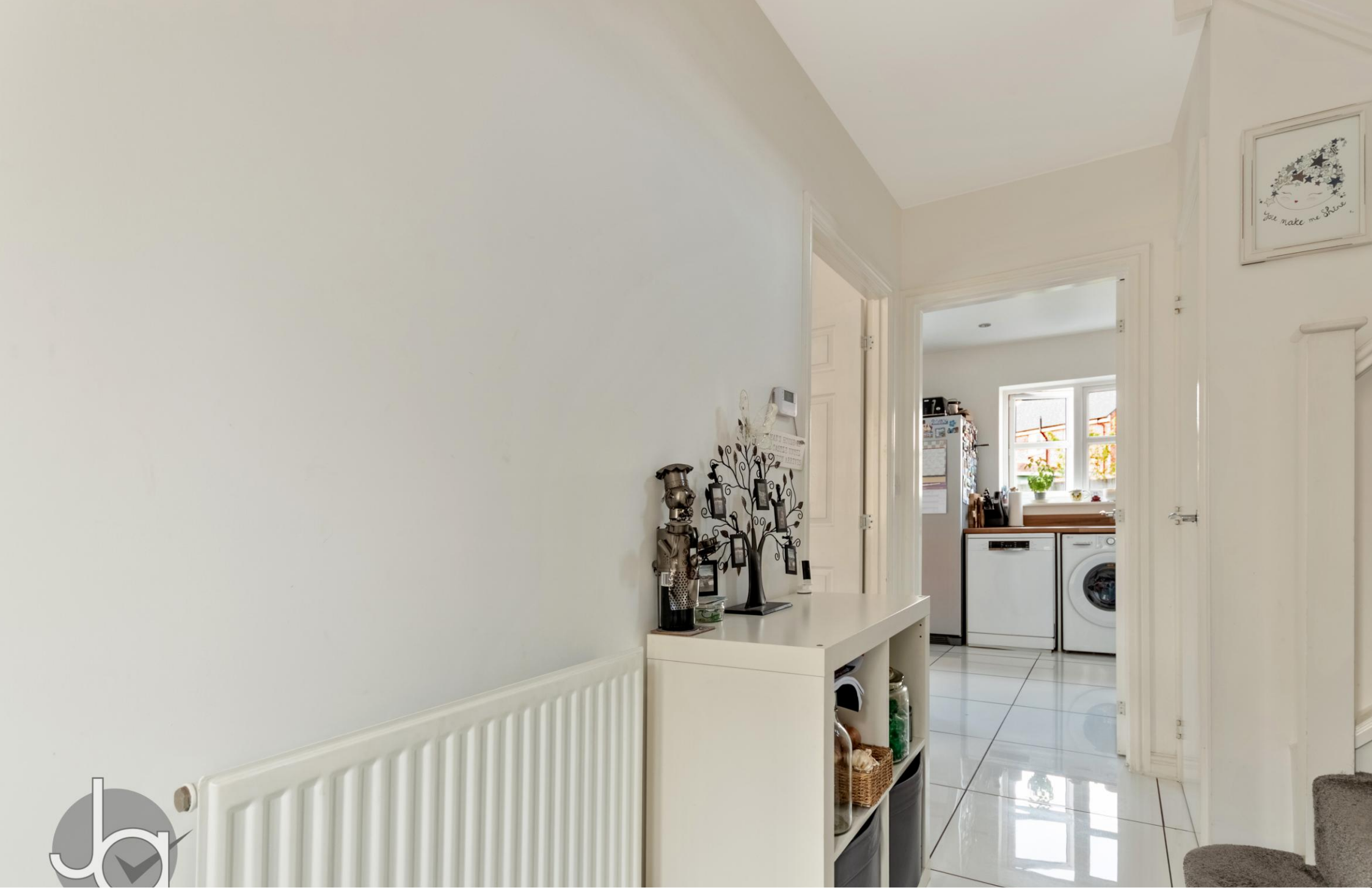
Otter Place, Stanway, Colchester, CO3 8AU