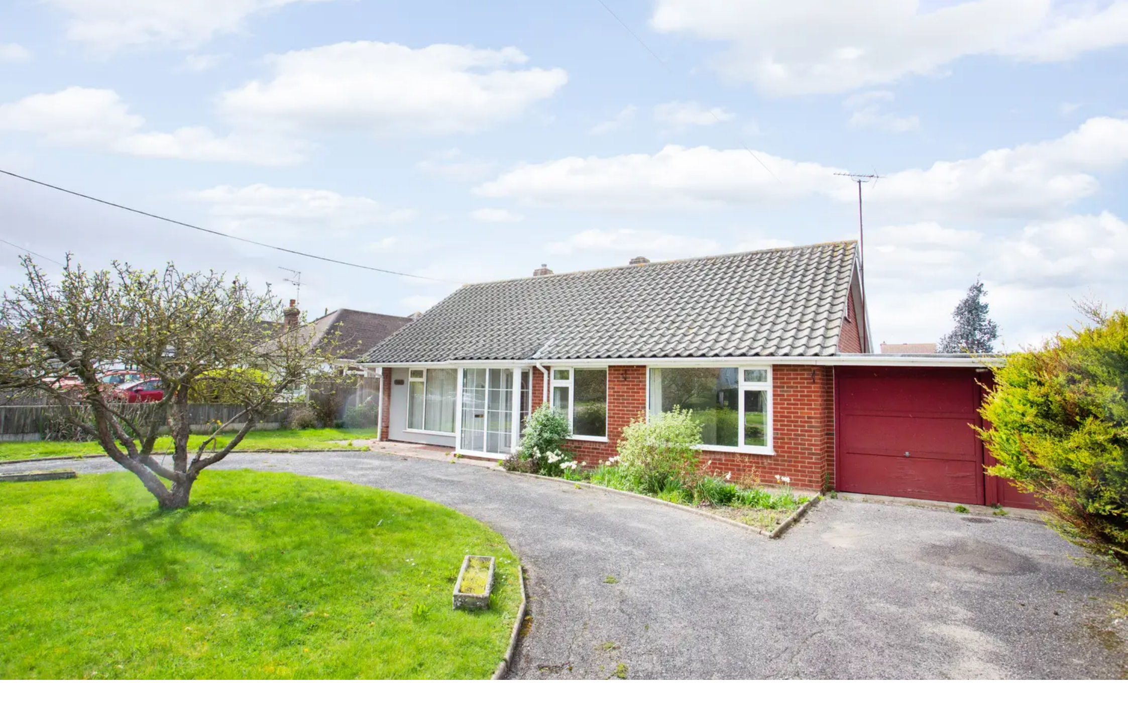
30 Chestfield Road, Chestfield In Excess of £600,000