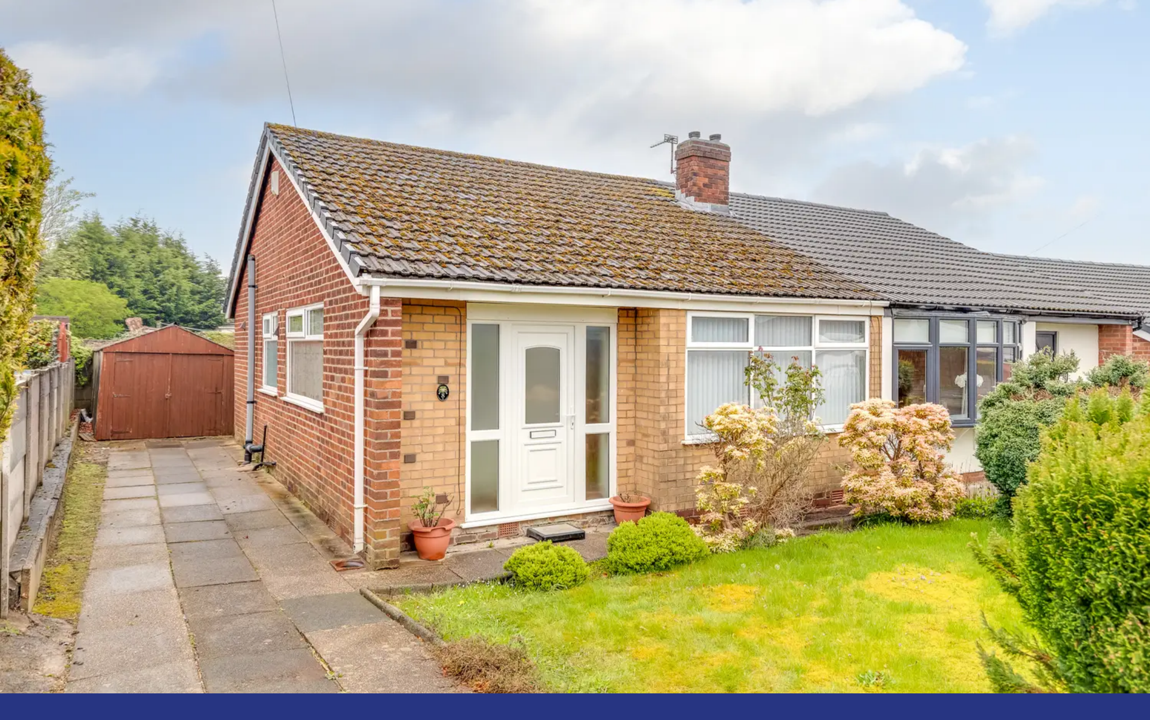
8 Ashfield Drive, Aspull Offers Over £180,000