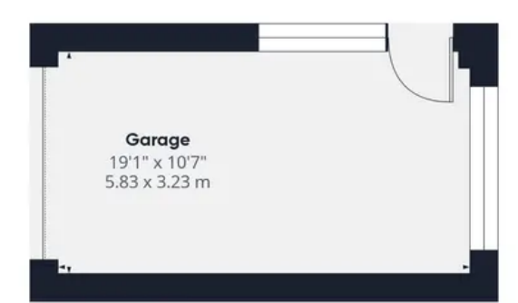
Floor 1 Building 2