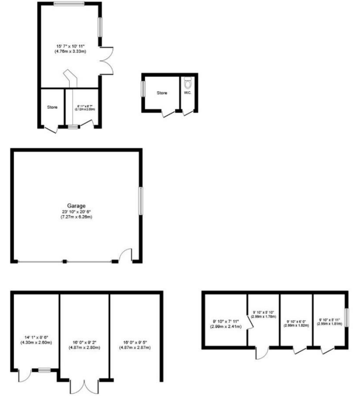
Outbuilding Approximate Floor Area 1,586 sq. ft. (138.0 sq. m.)

Whilst every attempt has been made to ensure the accuracy of the floor plan contained here, measurements of doors, windows, rooms and any other items are approximate and no responsibility is taken for any error, omission, or mis-statement. The measurements should not be relied upon for valuation, transaction and/or funding purposes. This plan is for illustrative purposes only and should be used as such by any prospective purchaser or tenant. The services, systems and appliances shown have not been tested and no guarantee as to their operability or efficiency can be given.