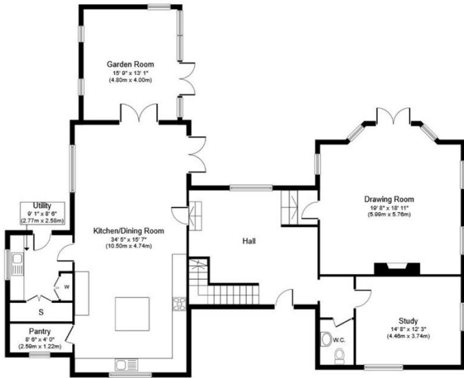
Ground Floor Approximate Floor Area 1,818 sq. ft. (168.9 sq. m.)