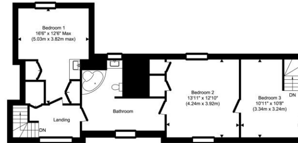
First Floor Approximate Floor Area 788.02 sq. ft. (73.21 sq. m)