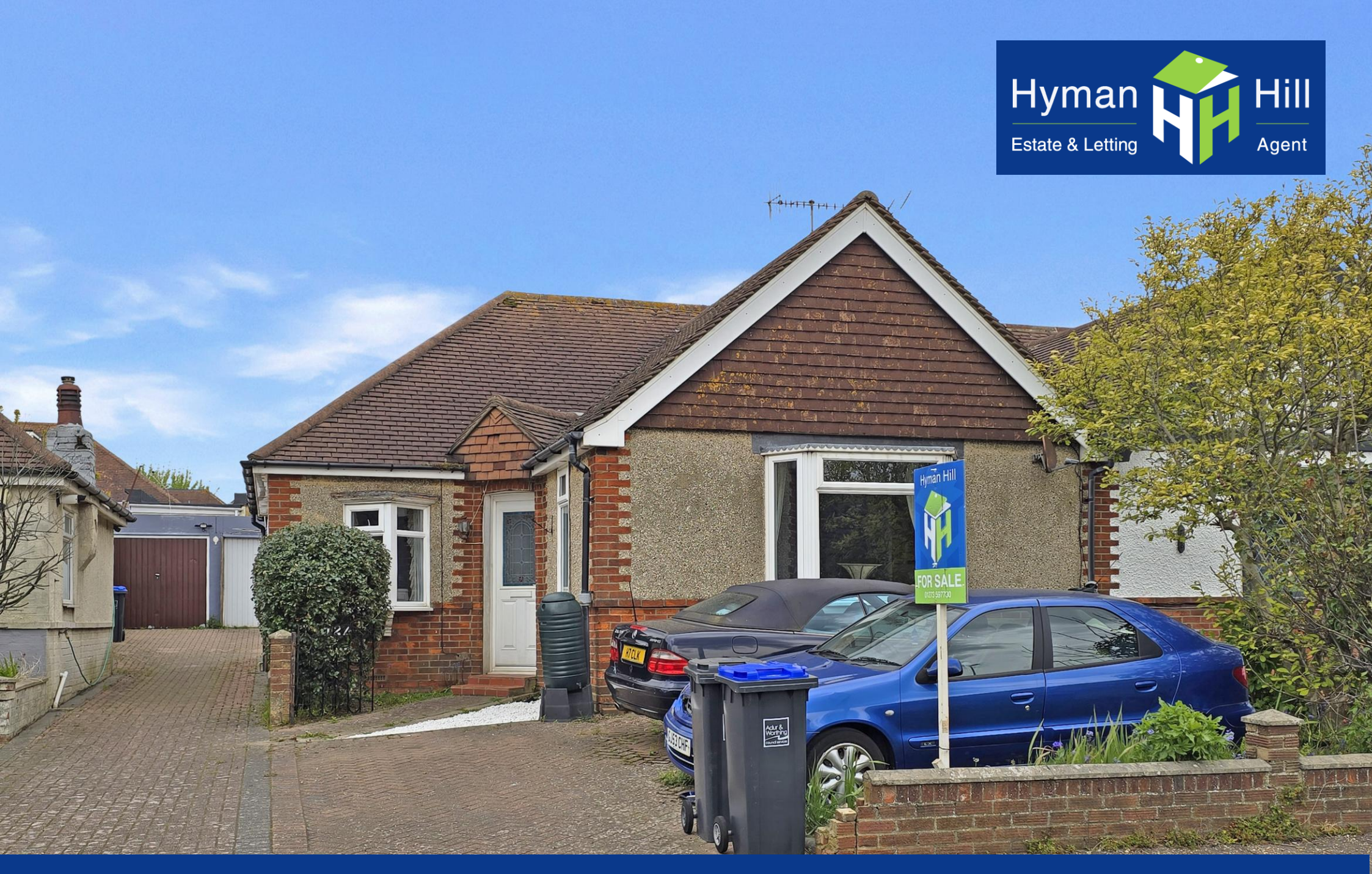
127 Old Shoreham Road (Slip Road), Southwick, West Sussex, BN42 4RB