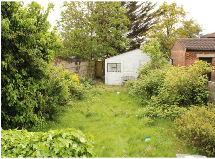
Total area: approx. 99.1 sq. metres (1067.1 sq. feet)