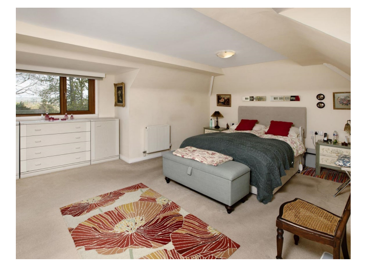
GENERAL REMARKS AND STIPULATIONS:

Tenure: The property is offered for sale freehold by private treaty with vacant possession on completion.