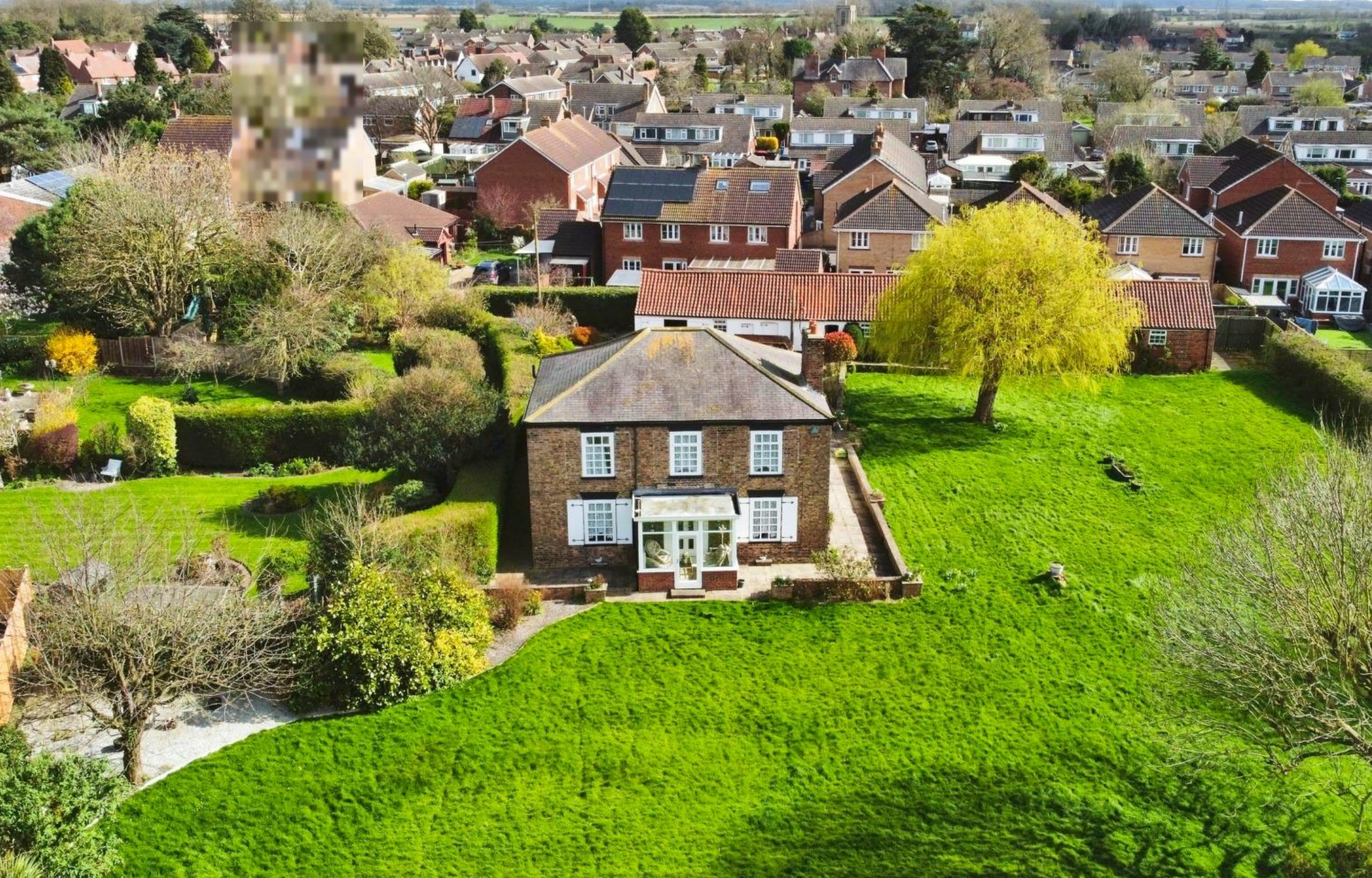
Glebe Farmhouse, Greens Lane, Wawne, East Riding of Yorkshire, HU7 5XT