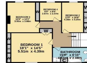
1ST FLOOR 875 sq.ft. (81.3 sq.m.) approx.