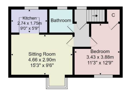
Total Area: 42.0 m<sup>2</sup> ... 452 ft<sup>2</sup>

All measurements are approximate and for display purposes only. No liability is accepted by either the agency or Box Property Solutions Ltd as to the exact measurements of the rooms. Box Property Solutions Ltd retains the copyright on this plan and allows agents to use it with agreed permission.