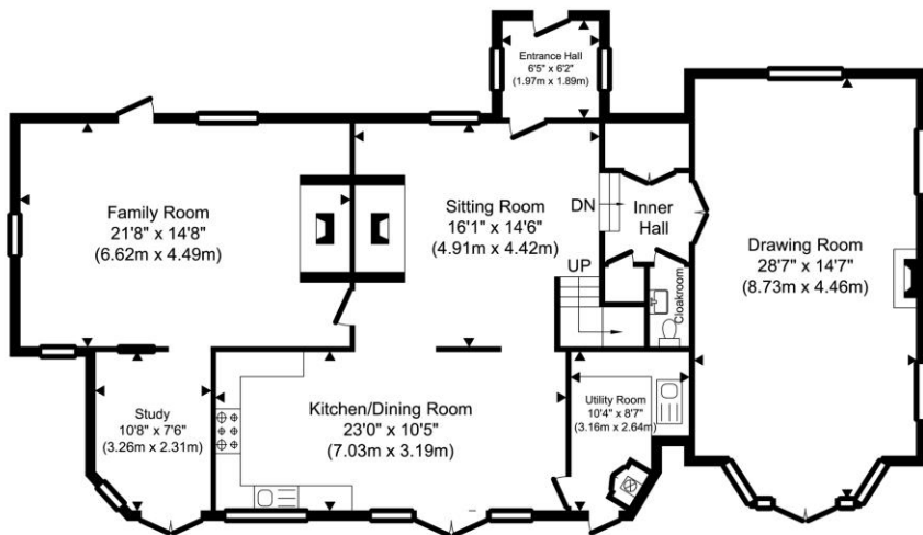
Ground Floor Approximate Floor Area 1490.90 sq. ft. (138.51 sq. m)