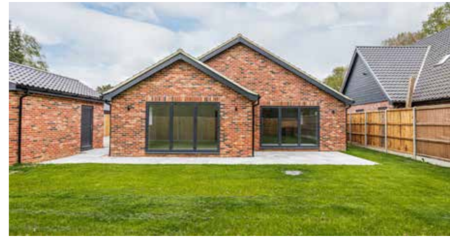
The rear garden, graciously abuts conservation woodland.

“...an exquisite blend of comfort and elegance.”