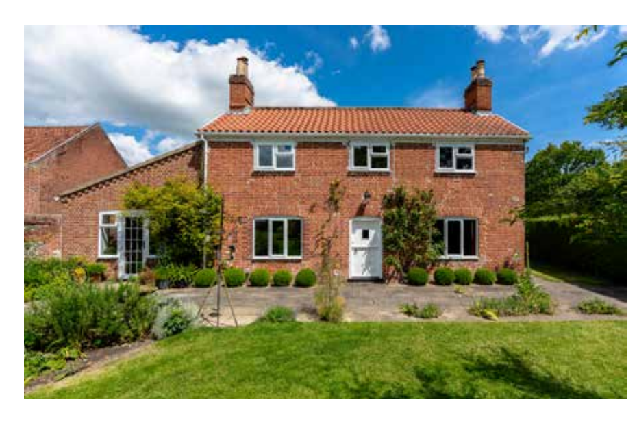
"This beautiful property embraces the aesthetic which this Norfolk Farmhouse offers."