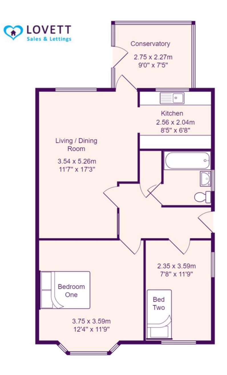
Total Area: 62.5 m<sup>2</sup> ... 672 ft<sup>2</sup>

All measurements are approximate and for display purposes only