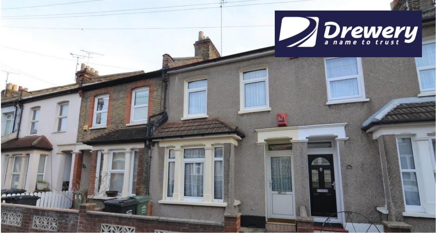
85 Anne Of Cleves Road, Dartford, Kent, DA1 2BQ £1,600 pcm