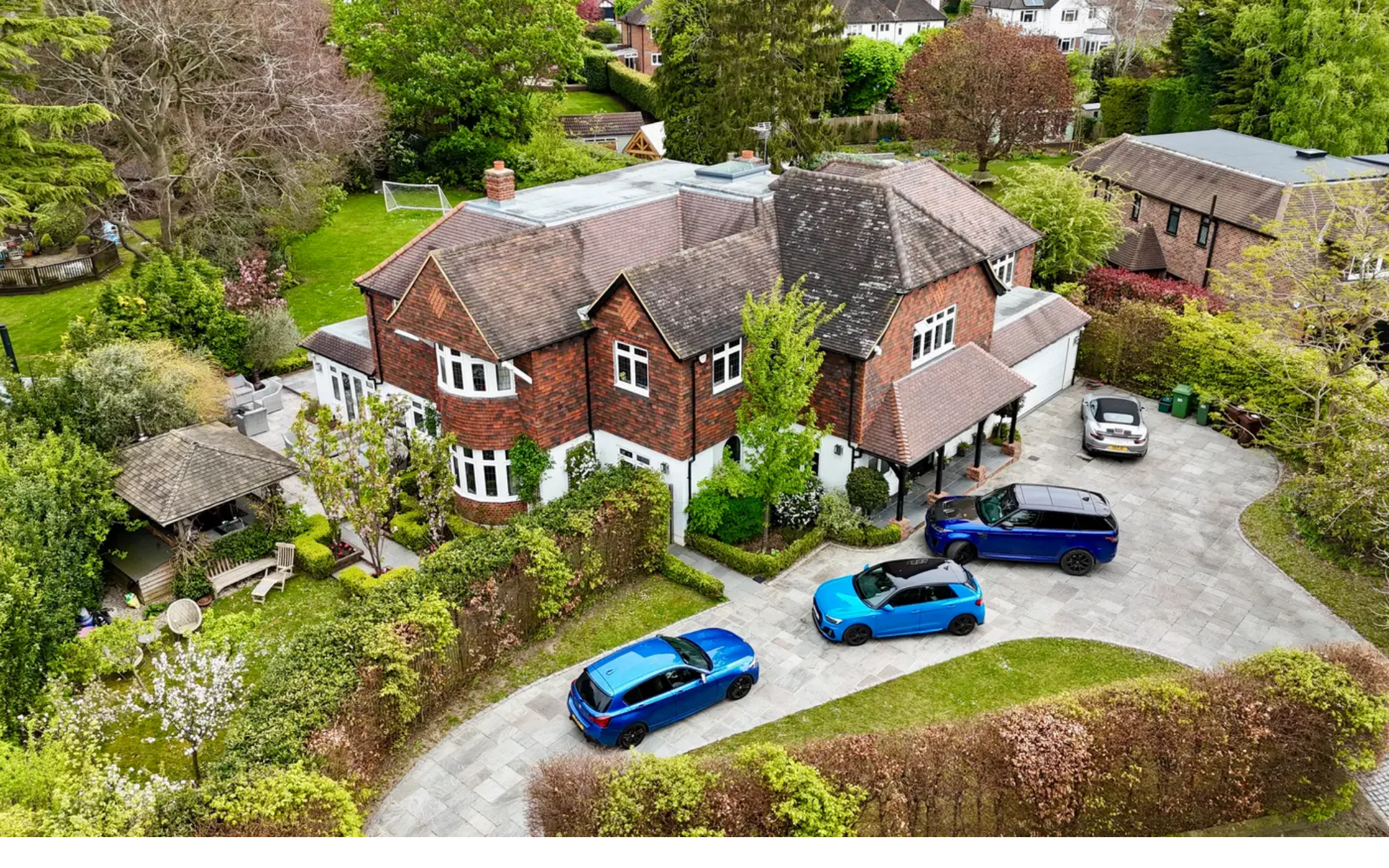
32 The Green, Epsom