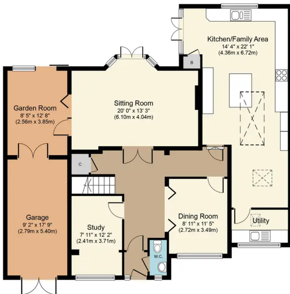
Ground Floor Approximate Floor Area 1,429 sq. ft. (132.7 sq. m.)