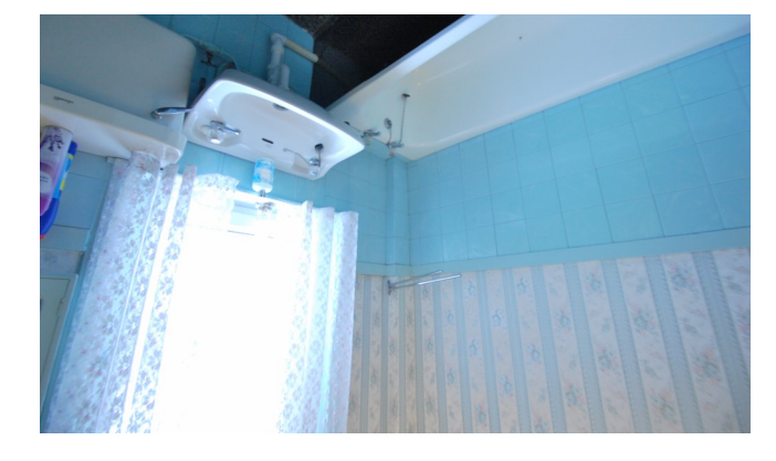
131 Ashley Terrace