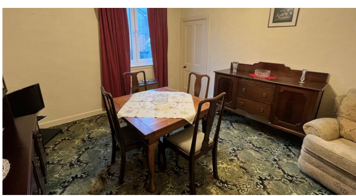
131 Ashley Terrace