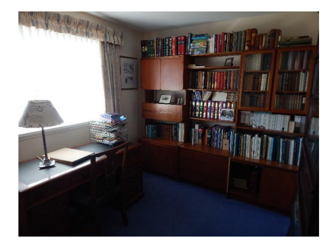
LIBRARY: (Formerly single garage) (12' x 8')

Useful additional room overlooking the front garden currently used as a study. Potentially an additional bedroom.