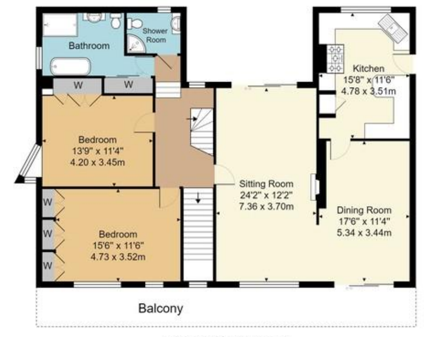
Lower Ground Floor Upper Ground Floor

Whilst every attempt has been made to ensure the accuracy of the floor plan contained here, measurements of doors, windows, rooms and any other items are approximate and no responsibility is taken for any error, omission, or mis-statement. This plan is for illustrative purposes only and should be used as such by any prospective purchaser or tenant. The services, systems and appliances shown have not been tested and no guarantee as to their operability or efficiency can be given.