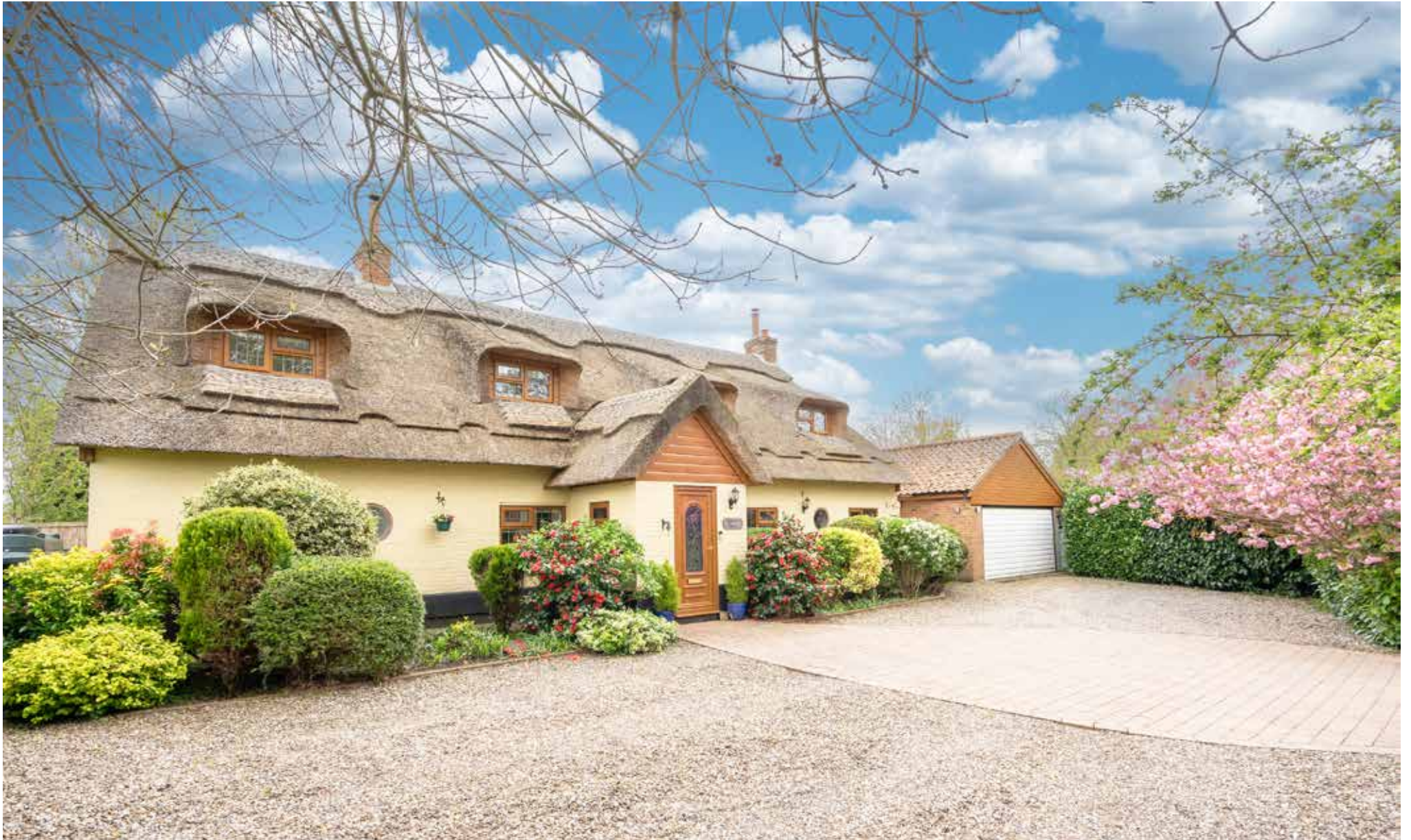
Sparrow House Common Road | West Somerton | Norfolk | NR29 4DN