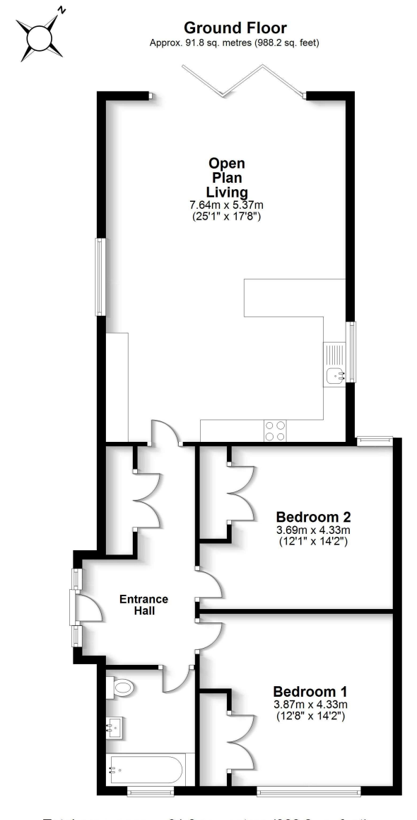
Total area: approx. 91.8 sq. metres (988.2 sq. feet)

FOR ILLUSTRATIVE PURPOSES ONLY - NOT TO SCALE The position and size of doors, windows, appliances and other features are approximate only. Total area includes garages and outbuildings - 3 My Home Property Marketing - Unauthorised reproduction prohibited. Plan produced using PlanUp.