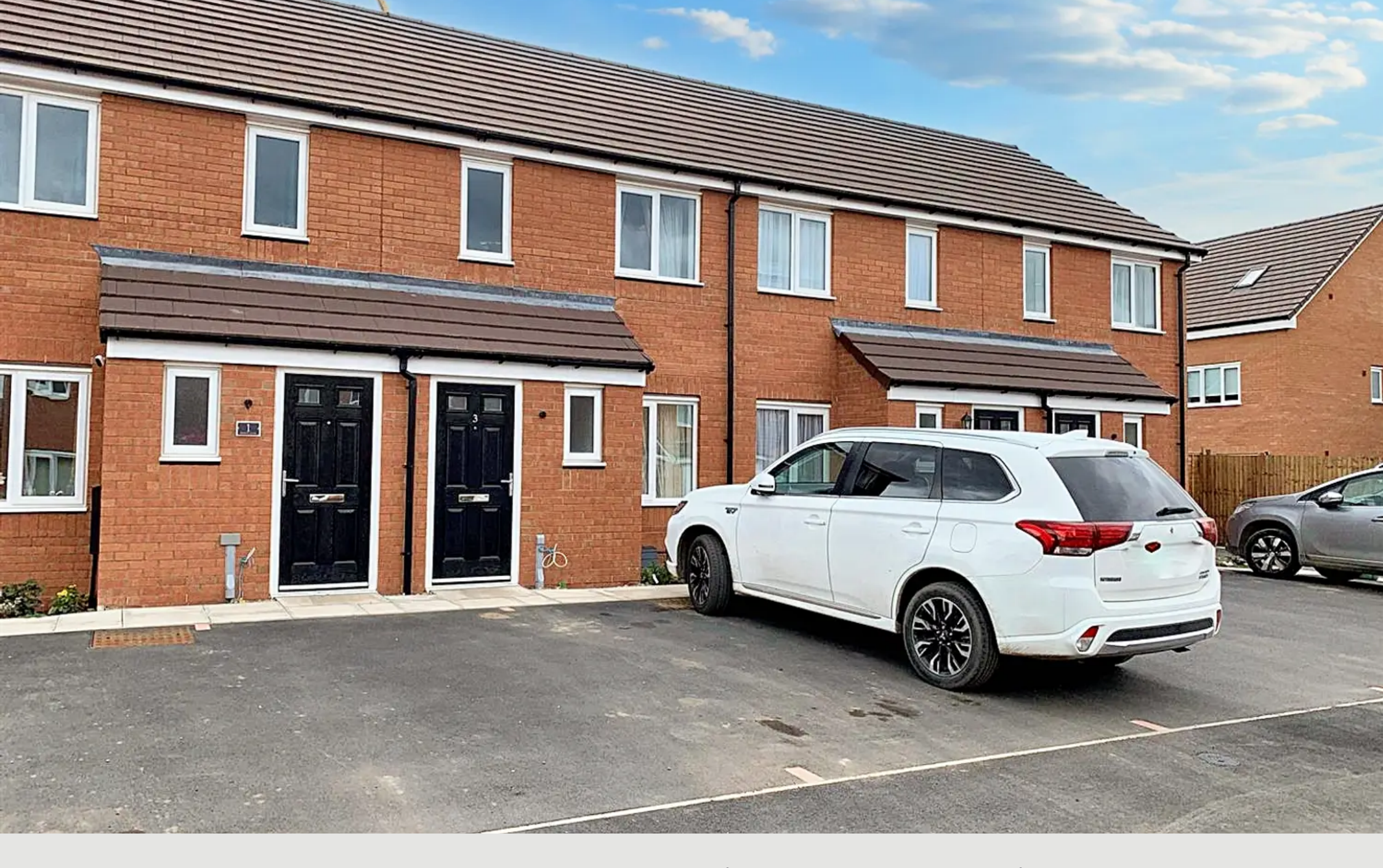
Mirpur Close, Foleshill, Coventry CV6 5QP