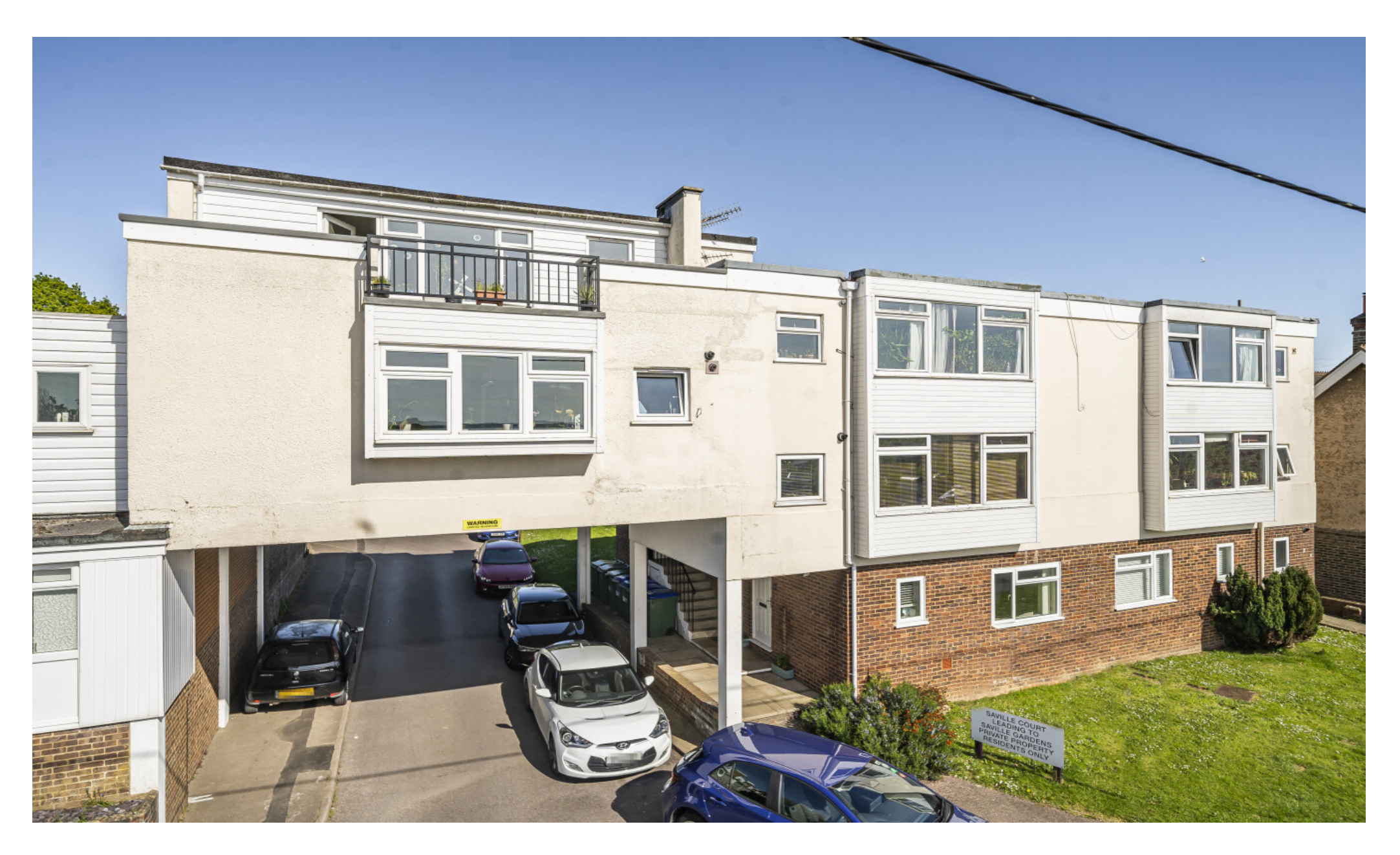
£225,000 Saville Court, Station Road, Billingshurst, West Sussex