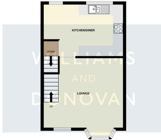
1ST FLOOR 373 sq.ft. (34.6 sq.m.) approx.