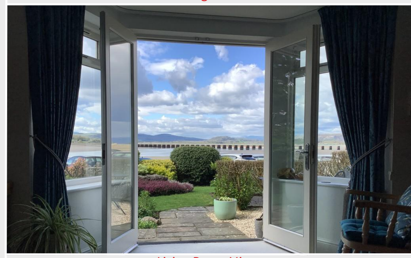
Living Room Views