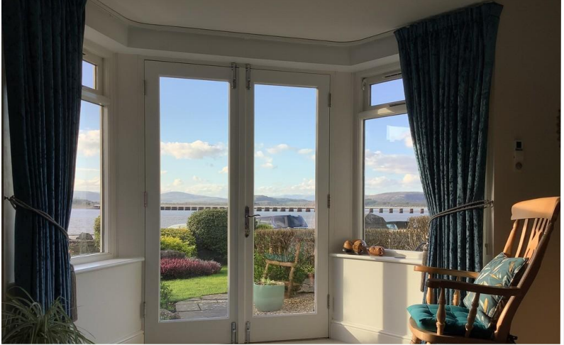
Living Room Views